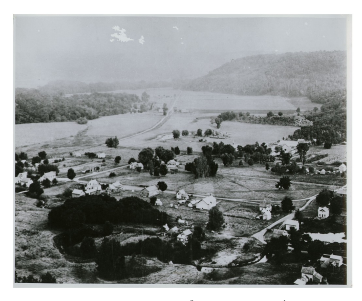
Town of Beaver—1800's

By 1900 the valley was changing. In less than fifty years the Whitewater River Valley had been transformed from pristine wilderness into a valley of 100 farms and 5 towns.