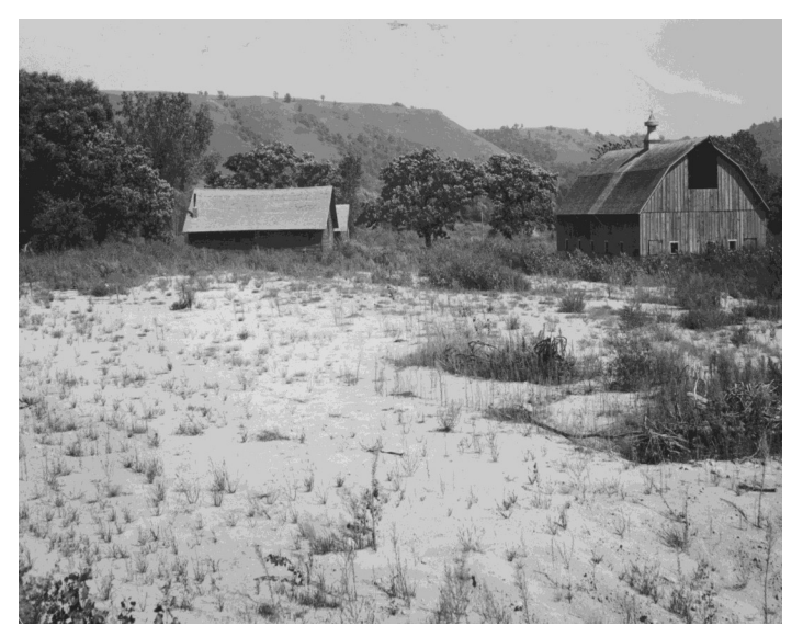
Old Ellringer Farm, Elba

Another result of the "New Deal" was the creation of the Soil Erosion Service (SES) to provide assistance to farmers for soil conservation. The SES was later renamed the Soil Conservation Service and is now known as the Natural Resources Conservation Service.