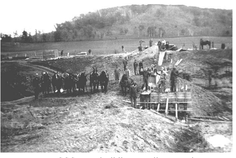
CCC crew building a gully control structure