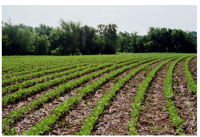
Conservation Tillage: Ridge Till

Having implemented conservation practices, both with and without government assistance, many landowners today know the importance of good conservation - for themselves and for future generations.