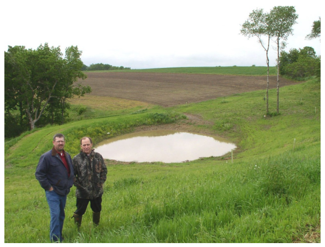
Grade Stabilization Structure / Pond

Conservation in the Whitewater River Watershed today is the result of a commitment by landowners; local, state, and federal conservation officials; and citizens of Minnesota to restore the watershed.